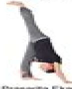
Urdhva Prashrita Eka Padasana

This asana is beneficial in edema, stiffness of spine, pain in hip joints and breathing problems. It removes the superfluous fat from the body. It is ideal cure to gastric problems.