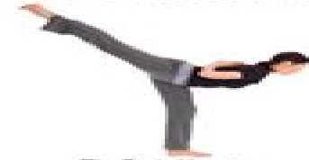
Eka Pada Hamsta Parivrtasana

This standing balance pose strengthens the ankles and thighs. It improves balance and cleanses the organs.