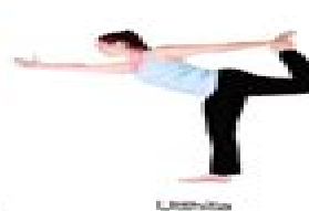
Urdhva Ardha Chandrasana

This posture improves balance and coordination. This opens the hip joints, stretches the hamstring muscles and tones the legs.