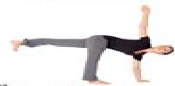
Parivrita Ardha Chandrasana

This pose stretches the back of the legs and improves the circulation in the abdominal organs. It calms the brain and stimulates the liver and kidneys.