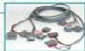
COP - JUNCTION HARNESS