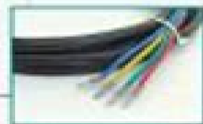
MACHINE ROOM HARNESS