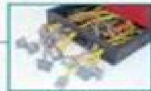
JUNCTION BOX HARNESS