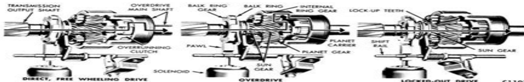
FIG. 6—Overdrive Power Flow

When the control handle is pulled out, the overdrive unit cannot function at any vehicle speed. This lockout is